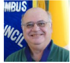
Grand Knight Council #4928