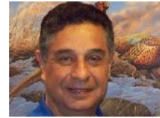
Grand Knight Council #9102