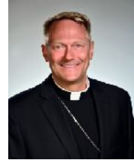
Eighth Bishop of Reno