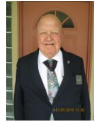
Grand Knight Council #8078