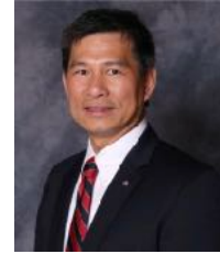
Immediate Past State Deputy