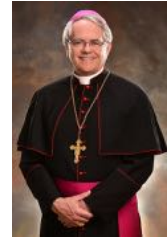
Third Bishop of Las Vegas Roman Catholic Diocese of Las Vegas