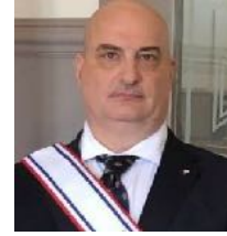
State Membership Director