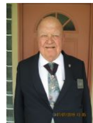
Grand Knight Council #8078