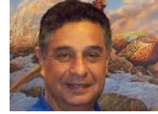
Grand Knight Council #9102